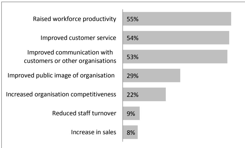
Figure 1: Benefits of Essential Skills Training

Base: All (300) Employers were asked 'Have you observed any the following impacts to organisational performance as a result of your involvement with the ESiW programme?'