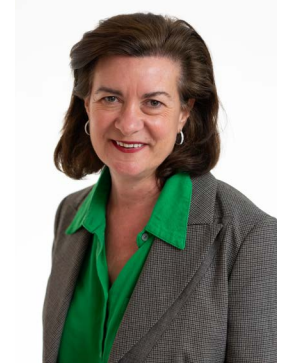
Eluned Morgan MS First Minister of Wales

Let us move forward with determination and optimism, knowing that our collective efforts will help create a more just, anti-racist and equitable society for all.