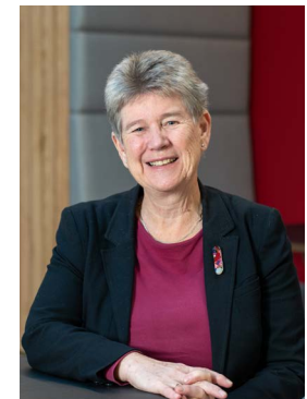
Jane Hutt MS