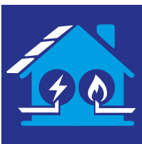
Buildings and Utilities

We deliver value through procurement across these seven category areas: