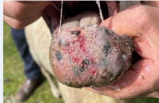
Ulcers and lesions in the mouth