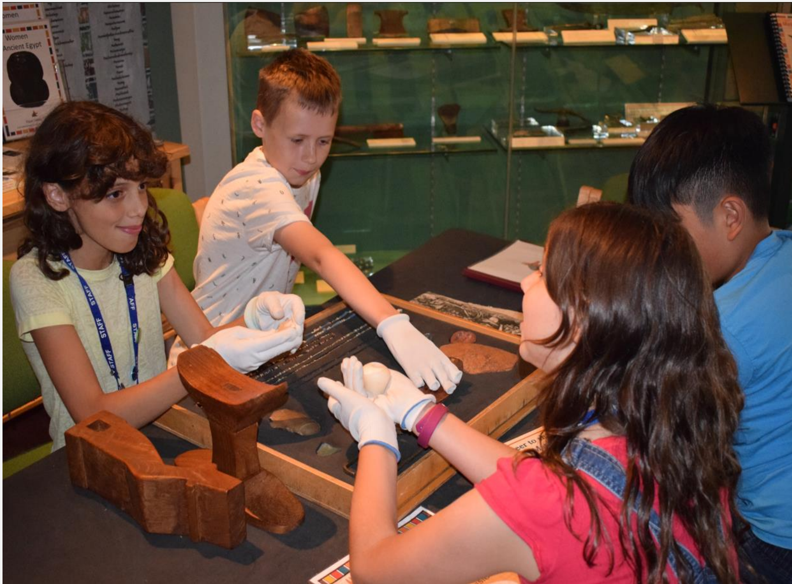
Young volunteers in the gallery

“The Egypt Centre strives to be as inclusive as possible. Through engendering a sense of family, belonging and community amongst its volunteers, it assists them to reach their true potential and improve not only their own lives, but also the lives of those who visit the museum”.