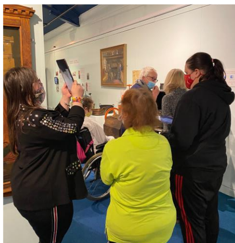
Canolfan Byron Group undertake evaluation.

The evaluation of the museum and exhibition spaces was undertaken in the form of verbal feedback and Makaton evaluation symbols with a Makaton specialist. This change to the standard method of collecting information ensured better inclusion as all participants were able to evaluate their experience.