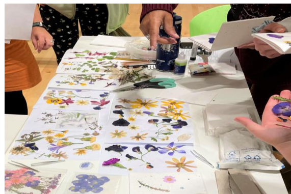
LGBTQ+ themed flower sketchbooks

Working with a local Conwy-based artist, participants created their own mini sketchbook using pressed/dried flowers inspired by LGBTQ+ references and symbols. A tote bag workshop inspired by the Pride Display at Colwyn Bay Library and Pride celebrations also proved popular.