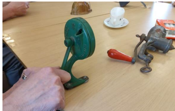
Object handling and reminiscence

provided themed reminiscence sessions, object handling and a craft-based activity.