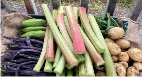
Harvesting produce improves physical wellbeing