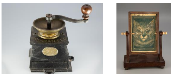
Selected artefacts for 'Objects in Focus'

Key terms were selected for use in the MODES database to highlight empire and colonies.