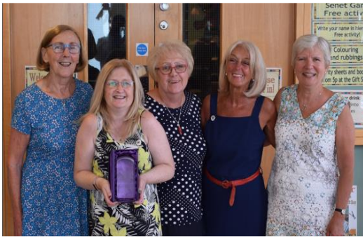
The Queen's Award for Voluntary Service

Young volunteers help on Saturdays by delivering demonstrations and tours. They may volunteer because they have been inspired by a workshop or seen other young people volunteering.