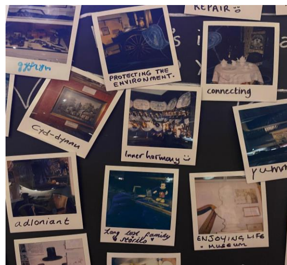
Perthyn Polaroid Responses

In this activity, 130 general visitors to the museum were asked to take a Polaroid photograph of an object on display. Participants were asked how it related to one of their life values and in what ways it was meaningful to them. The Polaroids were then integrated into a values map which improved understanding of community values.