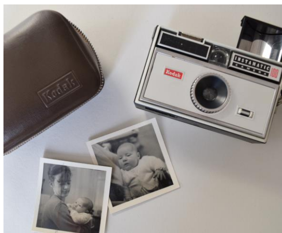
Holiday snaps and family celebrations

Cameras from different decades, such as the Kodak Brownie and Kodak Instamatic created square photographs depicting family scenes.