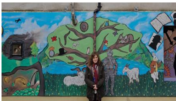
The garden wall mural

To ensure training is varied, use is made of staff expertise, retired educationalist input and museum experts.