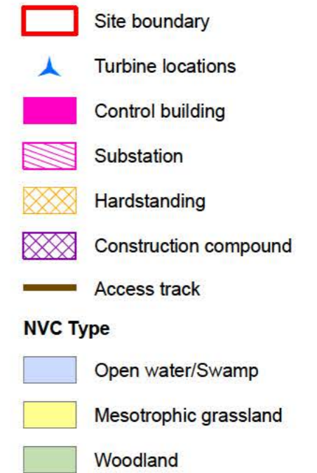
Figure 7.3 NVC