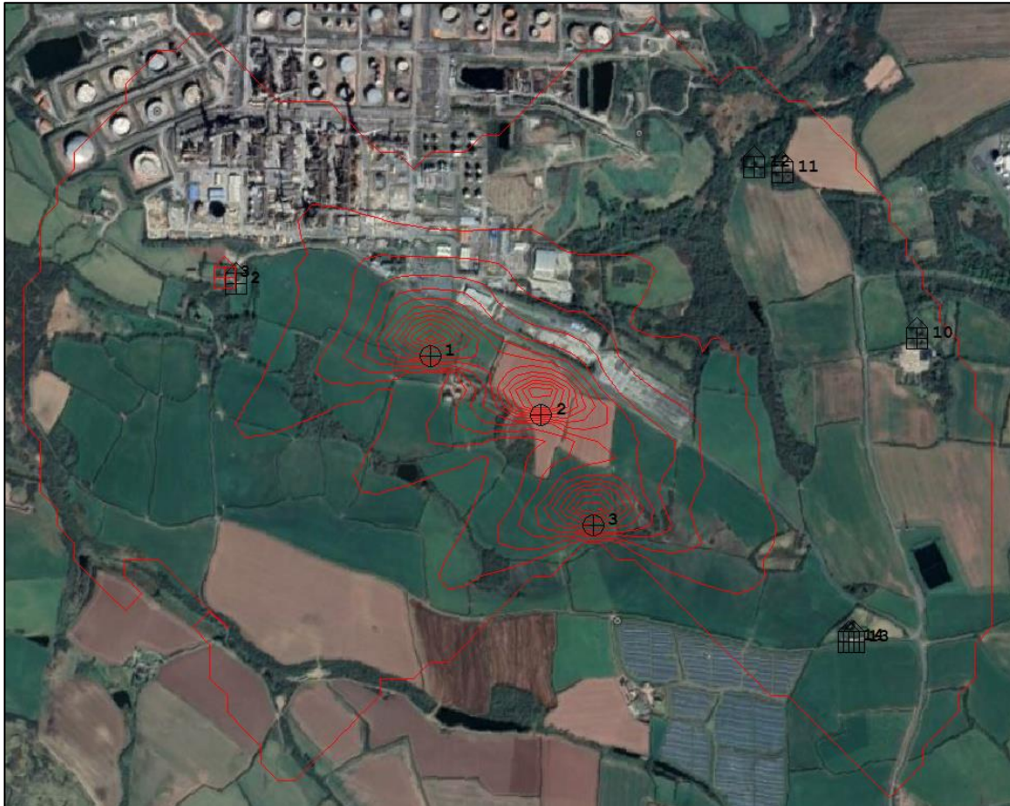
Contours – with map

13.1 The figure 1 below shows the shadow flicker contours associated with the proposed wind farm relative to the receptor locations. The contour spacing is 50 hours per year.