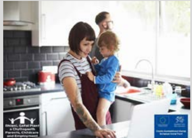
PaCE is assisting parents where childcare is a barrier to work