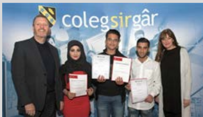
Students supported by the Cynnydd project receiving their Nation of Sanctuary Awards

Three young Syrian refugees supported by the EU-funded Cynnydd project were celebrated at a prestigious Nation of Sanctuary Awards held in Cardiff.