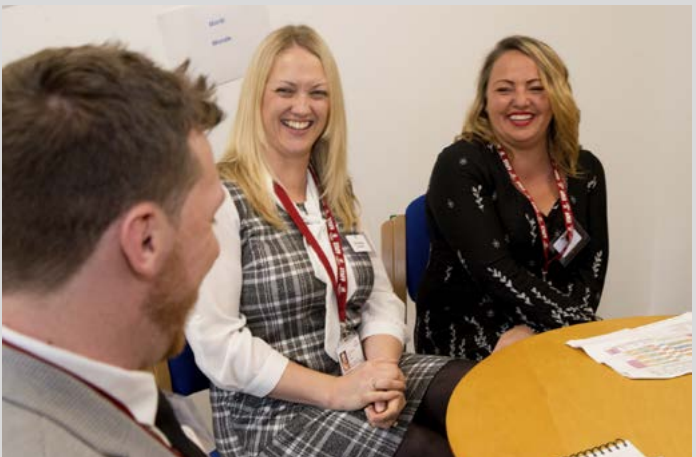
Rhondda Cynon Taf County Borough Council is supporting SME's to ensure people have access to 'in work' support services for their health and wellbeing needs