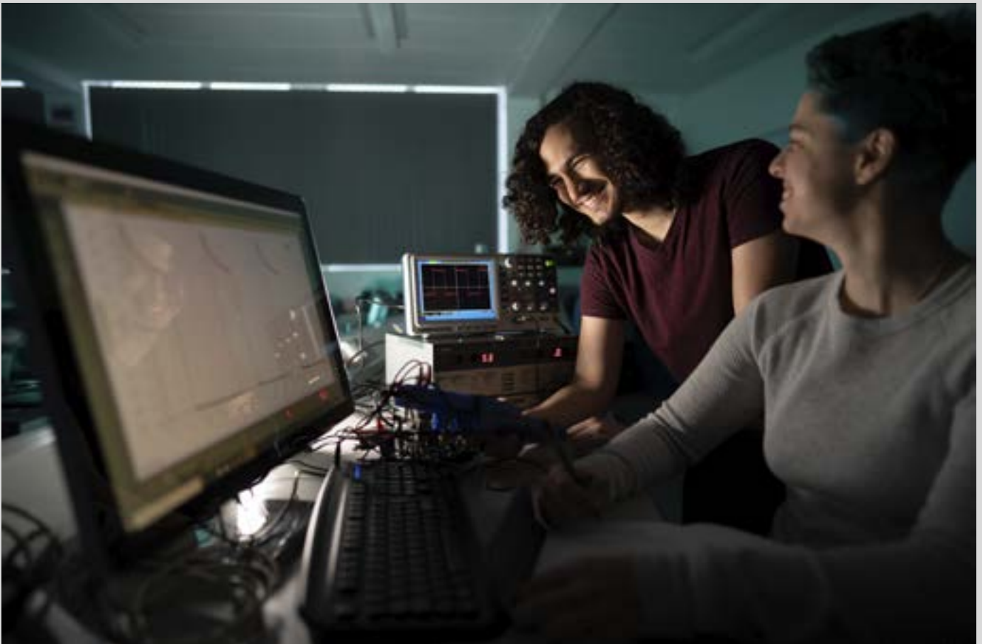
Aberystwyth University is supporting Creative Industries in Wales by delivering a high-level skills programme to people working in the sector