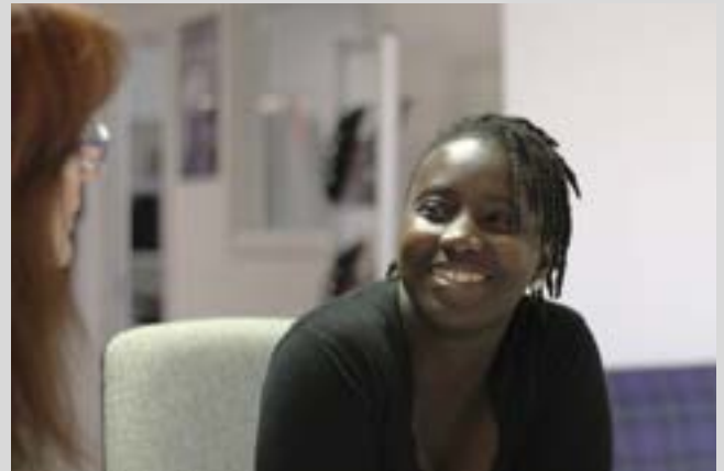
Gower College's Better Jobs Better Futures programme is boosting the skills and prospects of people in Swansea