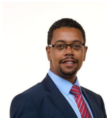
Vaughan Gething AM, Cabinet Secretary for Health, Well-being and Sport

It is encouraging that professionals, service users, community health councils, third sector and other organisations have worked together to produce this Framework of Action which is designed to work across an integrated system of Health and Social Services in Wales.