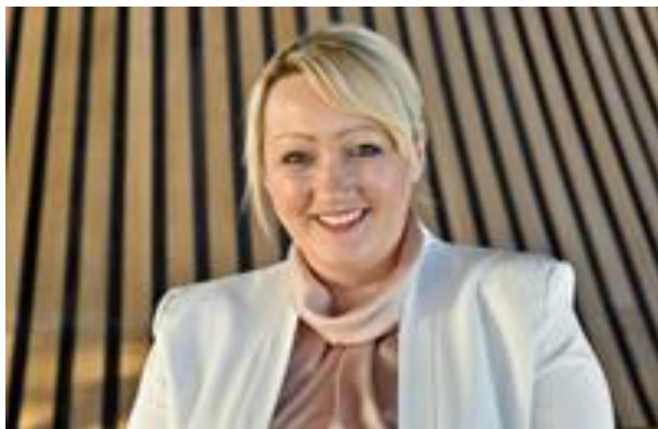
Rebecca Evans, AM Minister for Social Services and Public Health