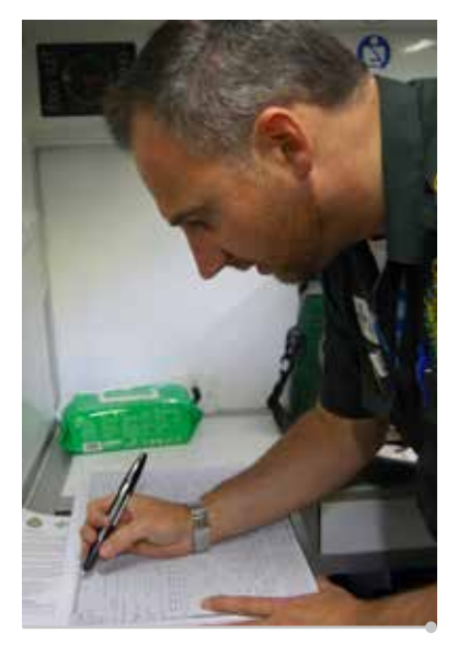
Paramedic using a Digipen in an ambulance

Information in the electronic record must be collected, recorded and stored in a way which allows it to be used and shared accurately and consistently without any risk of loss or change in meaning. This requires national standards for the content and structure of the record. Standardisation of the record structure and of the content will be essential to joining up the care record entries and providing staff with an integrated information base to ensure safe, high-