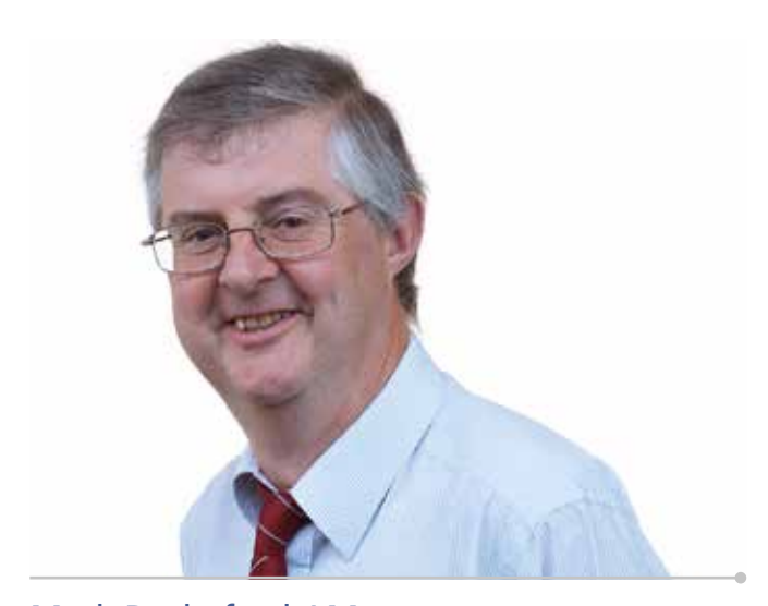
Mark Drakeford AM Minister for Health and Social Services

We should be able to view our own information relating to our health and care to enable us to take care of ourselves and continue to live independently for as long as possible and to play an active role in decisions about the services, care and support we need.