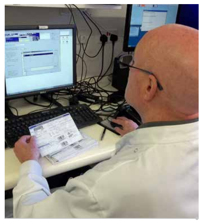
Pathologist checking results on the Welsh Laboratory Information Management System (LIMS)

All staff will be supported to understand their role and responsibilities in relation to confidentiality and information governance, and carrying out their roles using technology and digital services. A shift in resource will be required, from staff supporting paper-based working to new processes and work practices