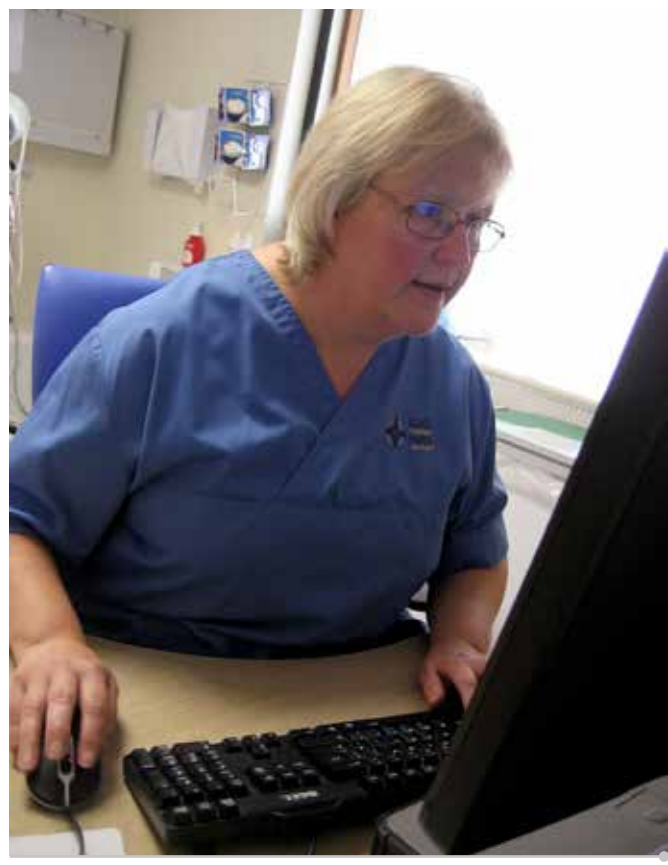
Staff Nurse Accessing the Welsh Clinical Portal

Our future success will, however, require more than technology. It requires a major change in the way that health and social care services embrace the opportunities set out in this strategy and manage the transition to new, digitally-supported working practices which enable the sharing of information, integrate team working and place the individual at the centre of their care. Cultural change, knowledge and skills development across our health and social care workforce will be a key area of focus. Changing attitudes and behaviours of people in Wales to adopt healthy lifestyles and become active participants in their care will require information, motivation and willingness to embrace the digital opportunities set out in this strategy.