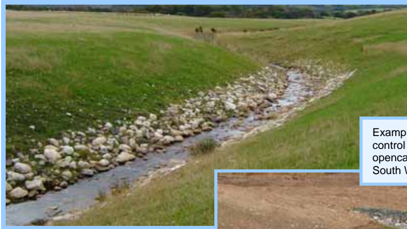
Examples of erosion control schemes at opencast coal sites in South Wales.