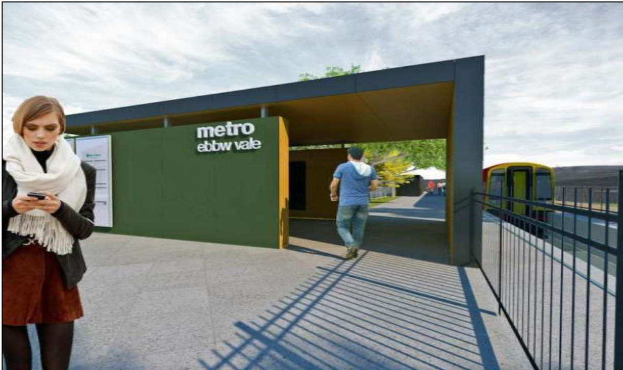
Figure 4 Illustration of proposed Ebbw Vale Town Station