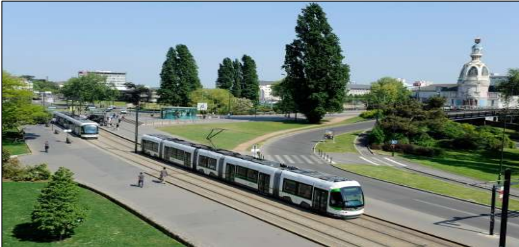
Figure 2 Urban Mobility and Trams in Nantes