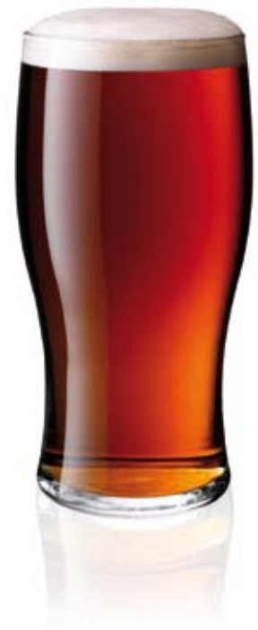
Pubs: The smoke-free law will extend to pubs and clubs

If you currently operate designated 'smoking rooms', these will probably now fall under the definition of 'enclosed' or 'substantially enclosed'. They will no longer be permitted under the new legislation. Information on creating outdoor smoking shelters can be found on page 10.