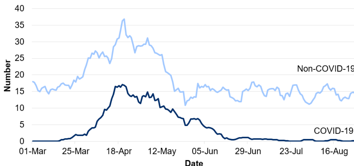
Chart 2: Deaths notified to Care Inspectorate Wales of care home residents by cause of death and day of notification (7 day rolling average), 1 March to 28 August 2020