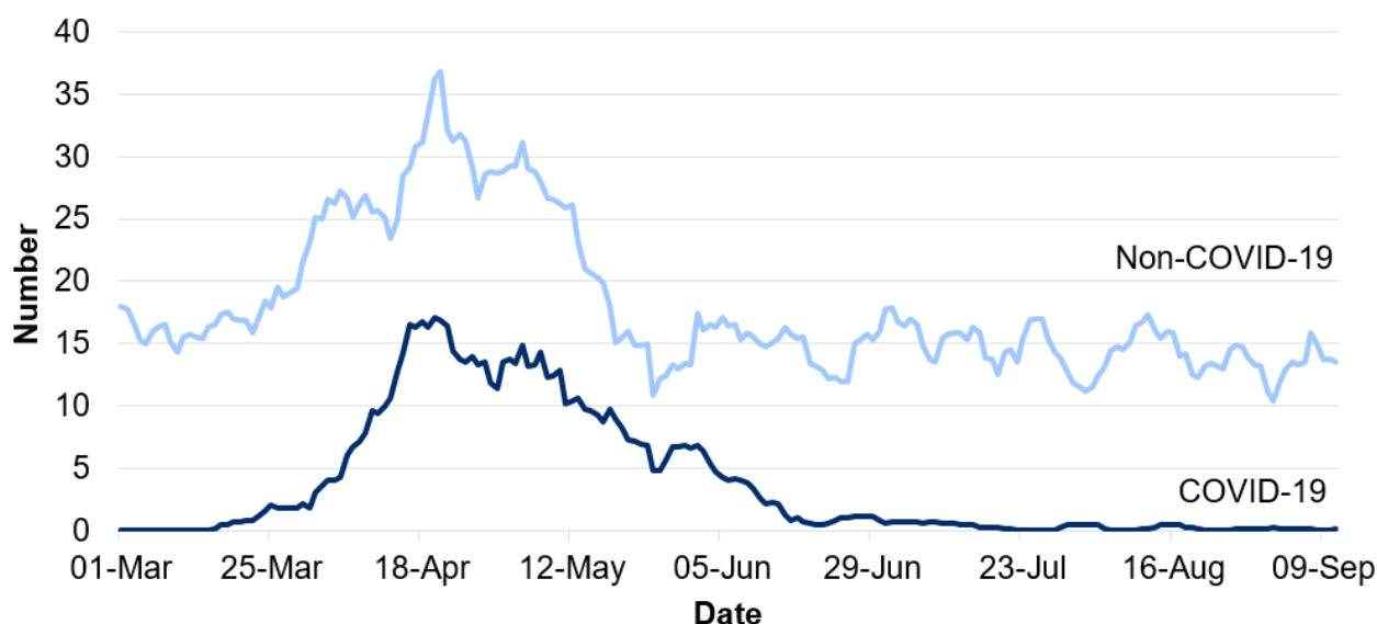
Chart 2: Deaths notified to Care Inspectorate Wales of care home residents by cause of death and day of notification (7 day rolling average), 1 March to 11 September 2020