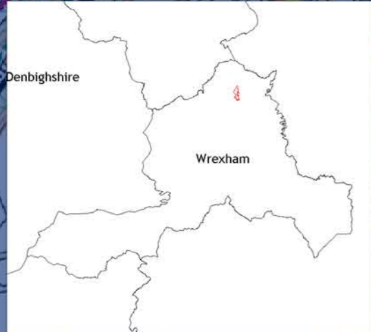
Map derived from O.S. 25k Raster