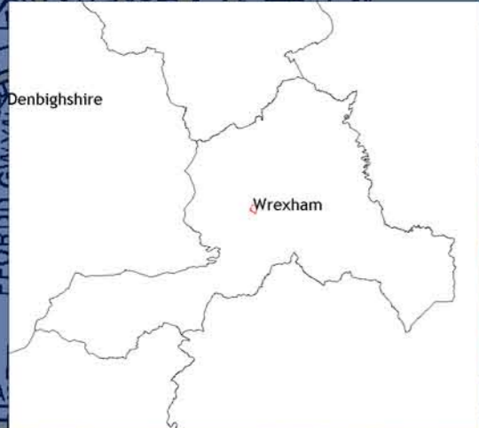
Map derived from O.S. 10k Landplan