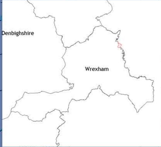
Map derived from O.S. 10k Landplan