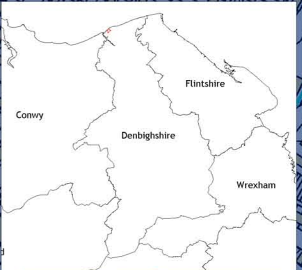
Map derived from O.S. 10k Landplan