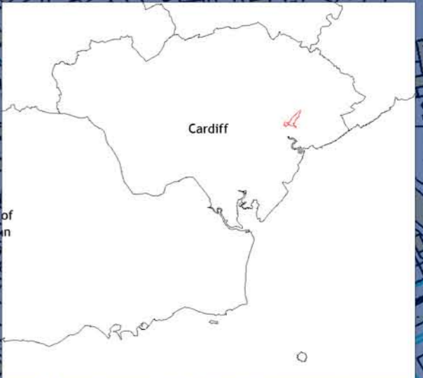
Map derived from O.S. 10k Landplan