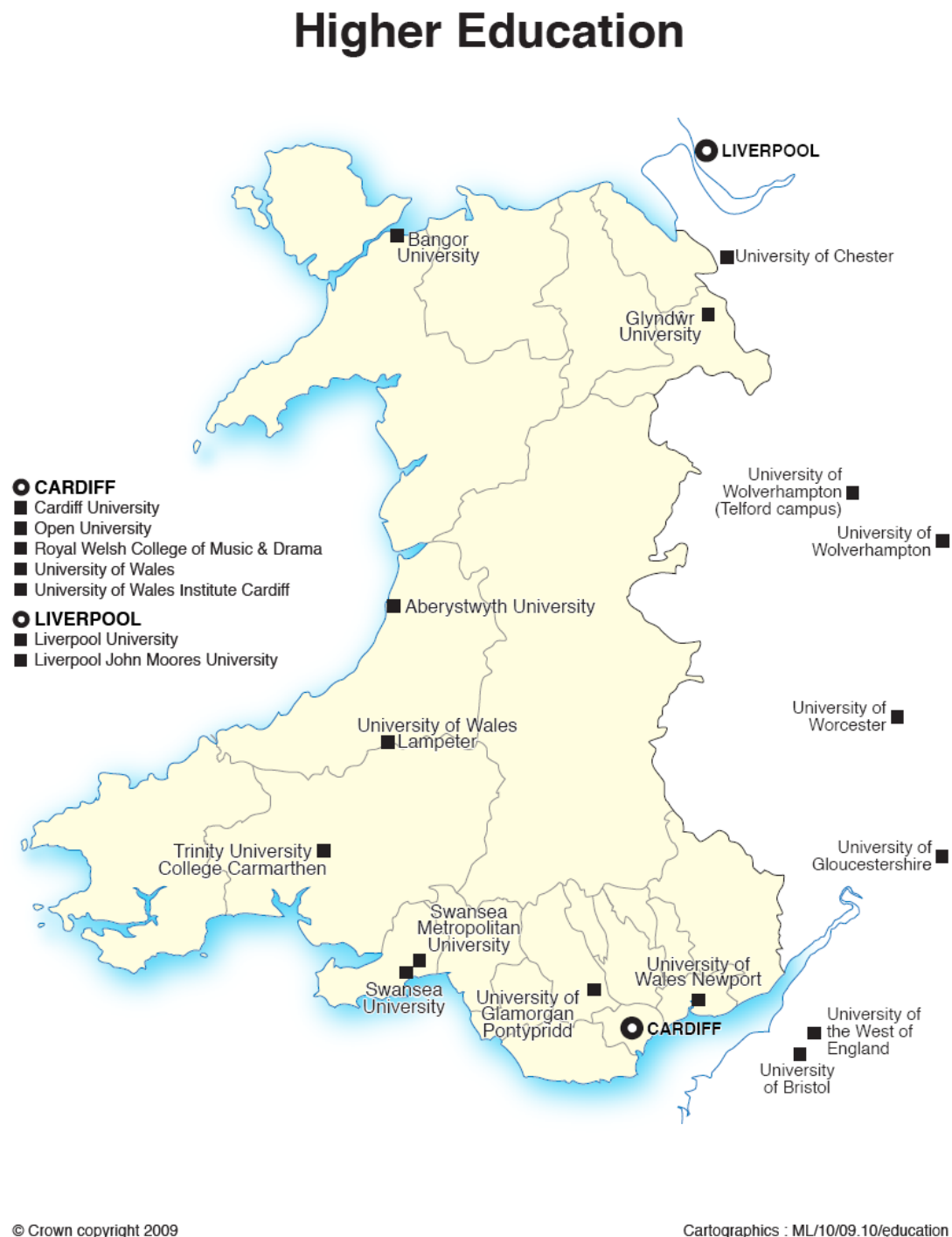
Figure 1: Locations of HE institutions in Wales 6 (showing nearby English HEIs)

4 The size of institution varies considerably as shown in Figures 2 and 3.